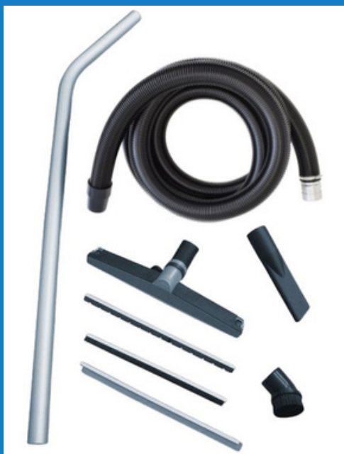
Antistatic cleaning tool kit 50 mm

If required, the bin can also be fitted with brackets, for example for a hall crane, making it easy to move the full bin.