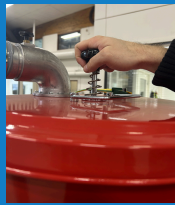
Manual filter cleaning